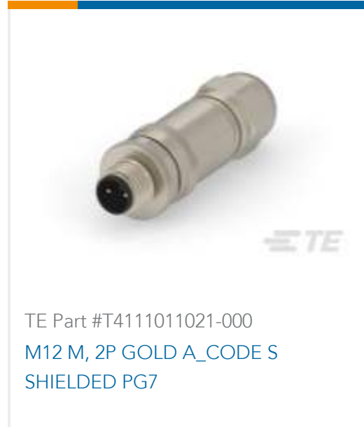
TE Part #T4111011021-000 M12 M, 2P GOLD A_CODE S SHIELDED PG7