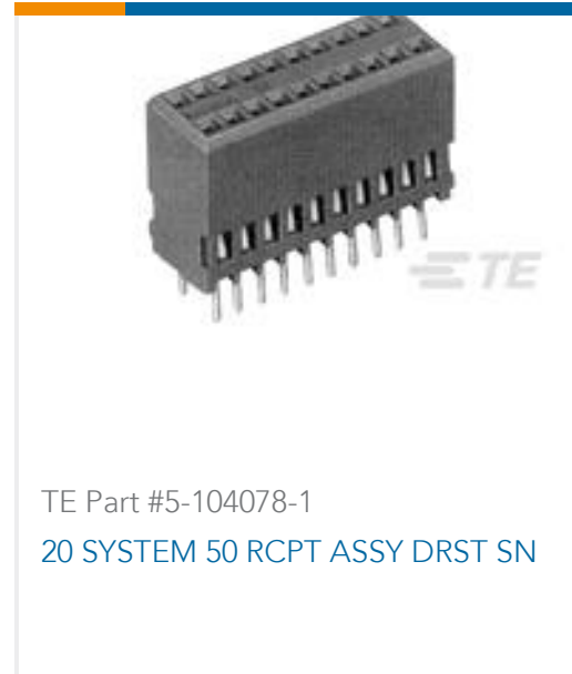
TE Part #5-104078-1 20 SYSTEM 50 RCPT ASSY DRST SN