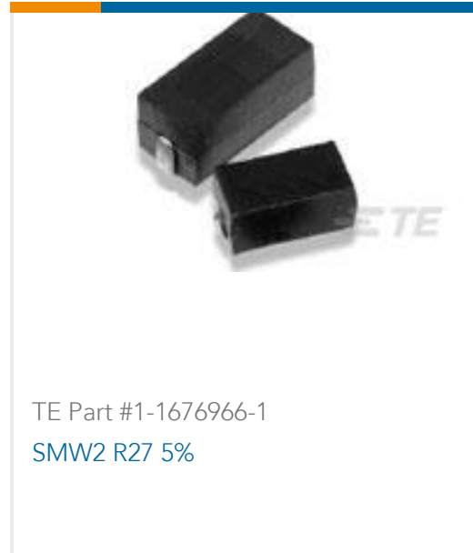
TE Part #1-1676966-1 SMW2 R27 5%