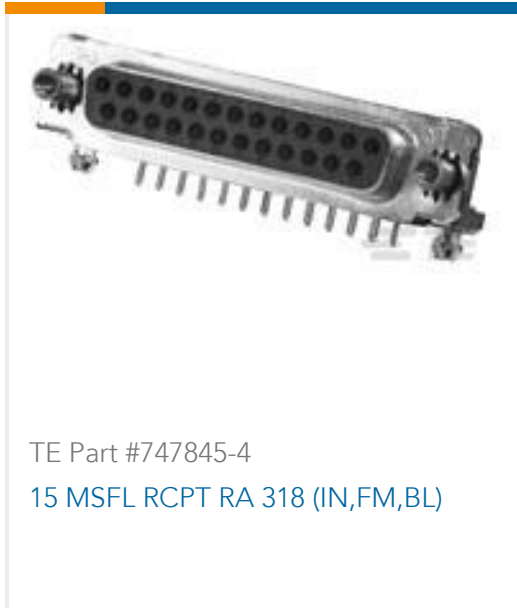
TE Part #747845-4 15 MSFL RCPT RA 318 (IN,FM,BL)