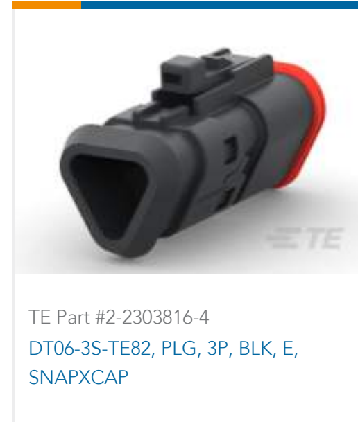
TE Part #2-2303816-4 DT06-3S-TE82, PLG, 3P, BLK, E, SNAPXCAP