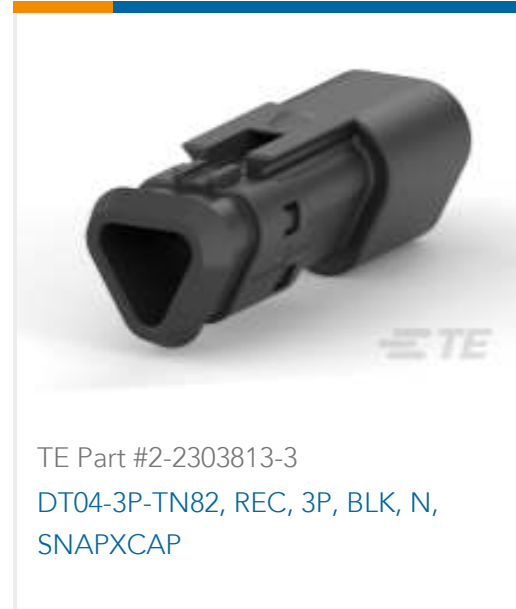
TE Part #2-2303813-3 DT04-3P-TN82, REC, 3P, BLK, N, SNAPXCAP