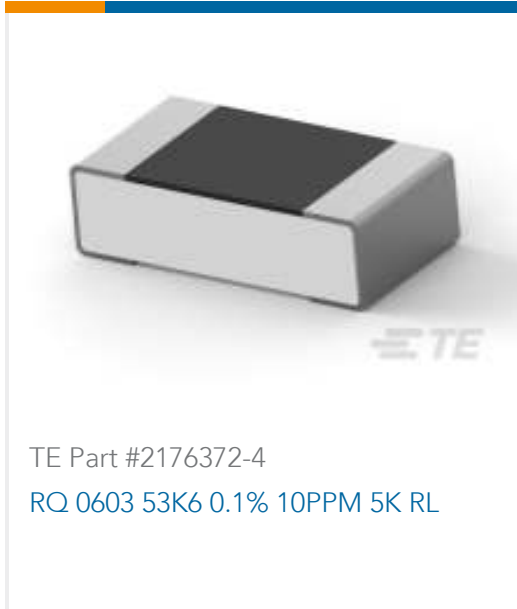
TE Part #2176372-4 RQ 0603 53K6 0.1% 10PPM 5K RL