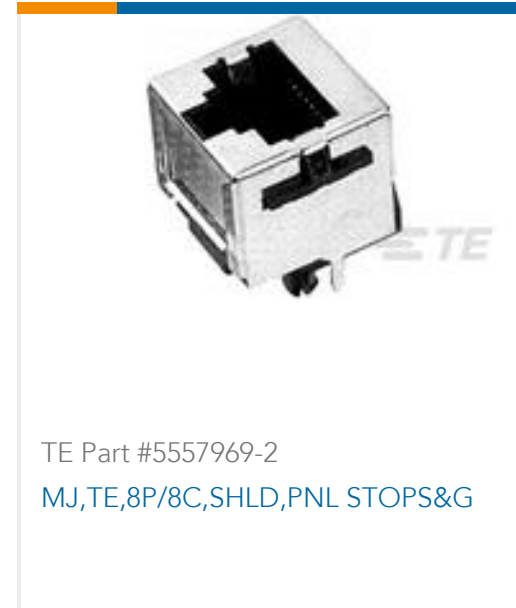
TE Part #5557969-2 MJ,TE,8P/8C,SHLD,PNL STOPS&G