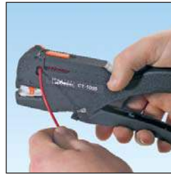
Semiautomatic Ferrule Crimping Tool CT-1000