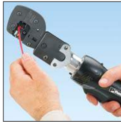
Battery Powered Crimping Tool CT-2500