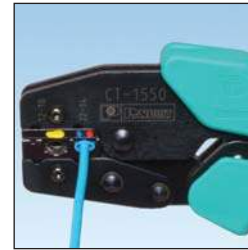
CONTOUR CRIMP™ Controlled Cycle Crimping Tools