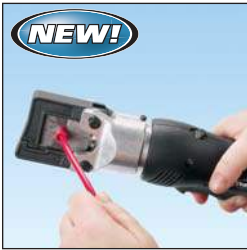
Battery Powered Hydraulic Crimping Tool CT-2600