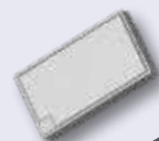
Known Good Die (KGD)

Bare Die Supplied in Tape and Reel and Fully Tested