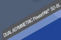
DUAL ASYMMETRIC PowerPAK® SO-8L

Optimized High and Low Side Combination for Synchronous Buck