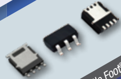
PowerPAK® Little Foot®

75 % Thinner and 55 % Smaller Than D 2 PAK