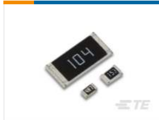
TE Part #2176341-3 CRGCQ 0805 15R 1%