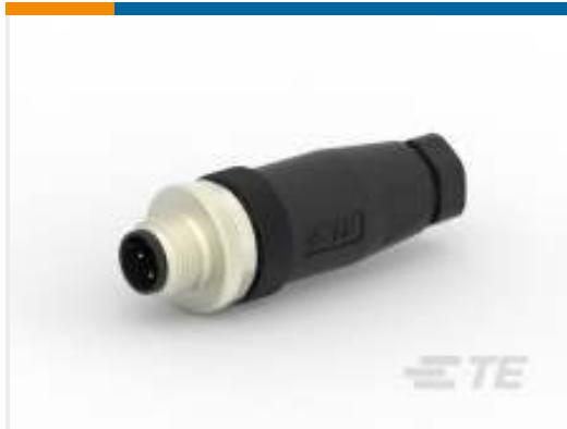
TE Part #T4111501041-000 M12,MALE,STRAIGHT,D CODE,4P, PG7,GOLD