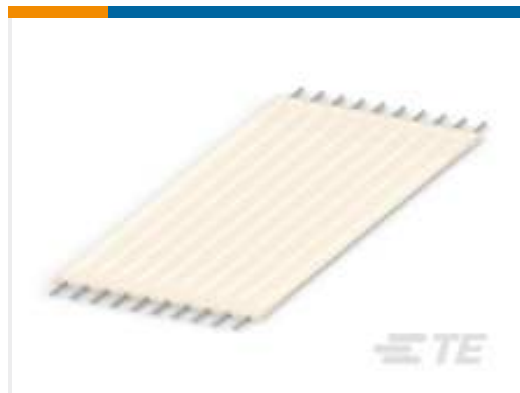
TE Part #3-1474644-8 FSN-24A-14