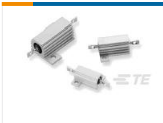
TE Part #2-1879074-2 THS15 47R 5%