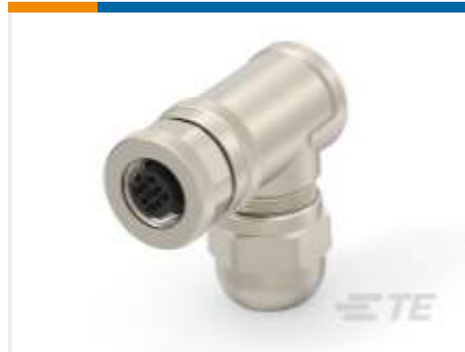
TE Part #T4112012051-000 M12 F, 5P GOLD A_CODE RA SHIELDED PG9