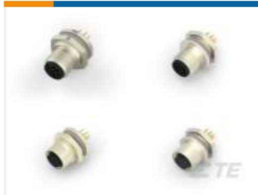
TE Part #T4140012051-000 M12 Panel Mount PCB