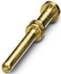
Crimp contact, turned, Single contact, Contact diameter: 2 mm, Crimp range: 0.25 mm 2 ...1 mm 2

Please be informed that the data shown in this PDF Document is generated from our Online Catalog. Please find the complete data in the user's documentation. Our General Terms of Use for Downloads are valid ( http://phoenixcontact.com/download )