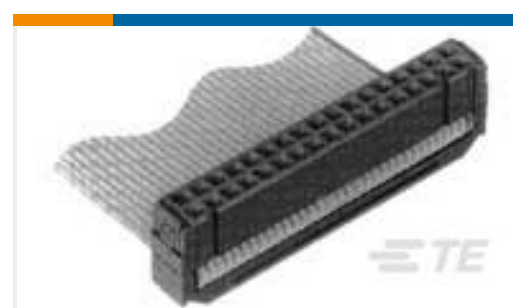
TE Part #1658623-2 14 NOVO MIL 30DP, LEAD FREE