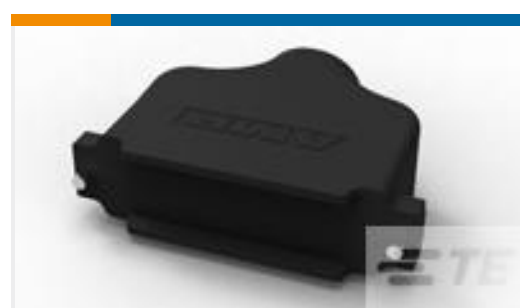
TE Part #5745175-1 CABLE CLAMP KIT,SZ 5