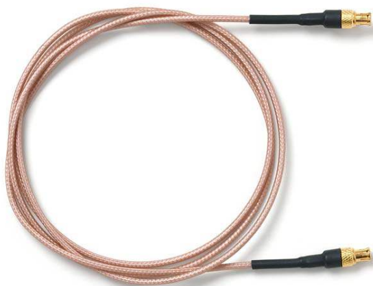
Model 73075-UU MCX Plug to MCX Plug, RG178B/U, 50 Ohm

MCX Plug to MCX Plug, RG178B/ U (50 Ohm), RG179B/ U (75 Ohm)