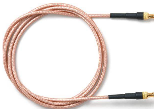
Model 73075-VV MCX Plug to MCX Plug, RG179B/U, 75 Ohm

Snap-on coupling and miniature size for fast connect and disconnect where space is limited