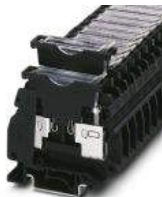
Fuse terminal block, cross section: 0.5 - 16 mm 2 , AWG: 18 - 8, width: 10.2 mm, color: blue

Please be informed that the data shown in this PDF Document is generated from our Online Catalog. Please find the complete data in the user's documentation. Our General Terms of Use for Downloads are valid ( http://download.phoenixcontact.com )