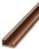
G-profile DIN rail, material: Copper, unperforated, height 15 mm, width 32 mm, length 2 m

DIN rail - NS 32 CU/35QMM UNPERF 2000MM - 1201358