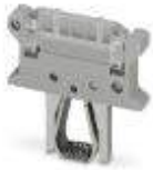
Isolating connector, for using the base fuse terminal block as plug disconnect terminal block