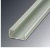
G rail 32 mm (NS 32)

DIN rail - NS 32 AL UNPERF 2000MM - 1201028