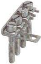
Switching jumper, Number of positions: 4, Color: silver

Please be informed that the data shown in this PDF Document is generated from our Online Catalog. Please find the complete data in the user's documentation. Our General Terms of Use for Downloads are valid ( http://phoenixcontact.com/download )