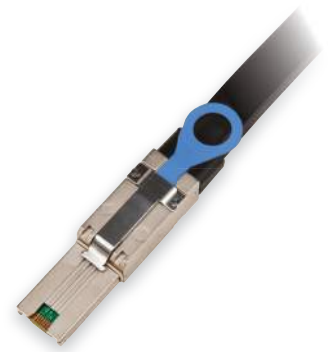
3M™ High Routability External MiniSAS Cable Assembly