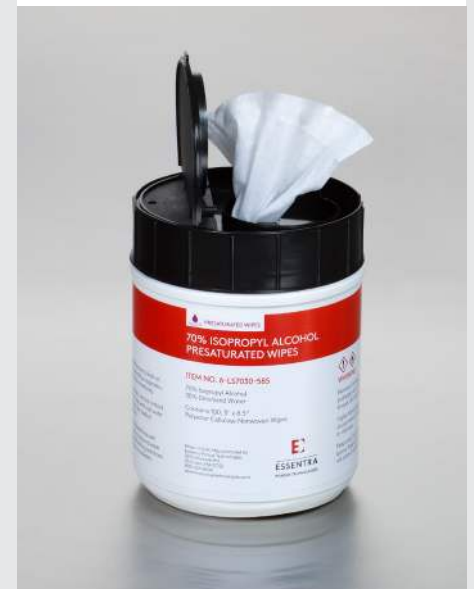
Economy-sized alcohol wipes

Quickly remove grease, inks and adhesives from equipment