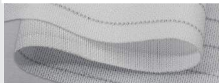
Negastat-enhanced carbon fiber wipes

Wipe away contaminants without static discharge