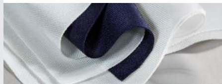
Cleanroom-ready woven polyester wipes

Clean grime and solder flux with confidence