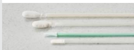
ESD swabs in wide-ranging configurations

Efficiently clean delicate components and hard-to-reach areas