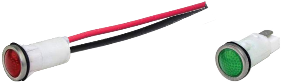
Examples: SPC472 in Panel Mount Indicators