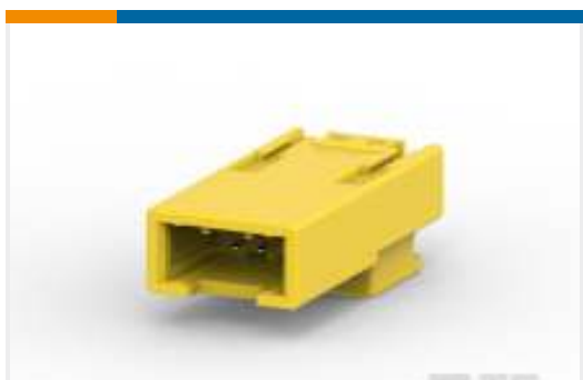
TE Part #1-2299960-1 TRAY PACKAGE.THERMOCOUPLE CONN KTYPE TAB