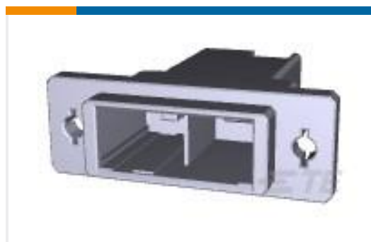
TE Part #1-353047-2 DYNAMIC D-5200S TAB HSG 2P K/X