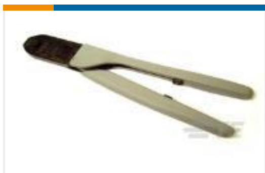
TE Part #91521-1 CCII TYPE III+ PIN SKT 18-14 ASSY