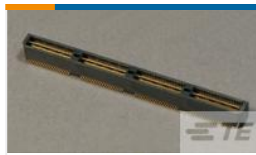
TE Part # 1-1658014-4 MSB0.80PL8ASY112DP,-,10,VCTY