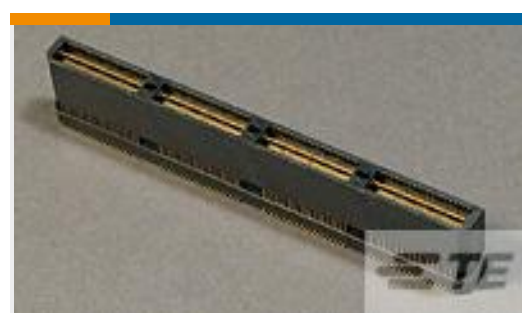
TE Part # 1658016-4 MSB0.80PL16ASY160FL,-,10,-TY