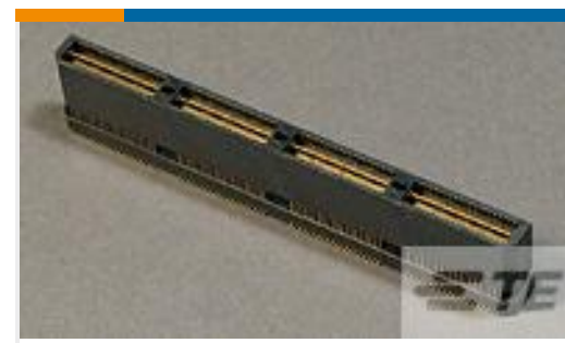
TE Part # 1-1658016-4 MSB0.80PL16ASY112DP,-,10,VCTY