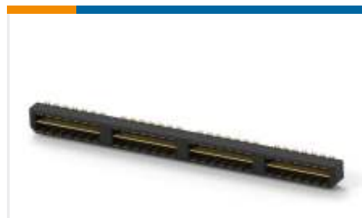
TE Part # 1-1658013-4 MSB0.80PL5ASY112DP,-,10,VCTY