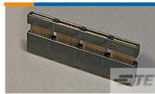
TE Part # 1-1658020-4 MSB0.80PL30ASY112DP,-,10,VCTY