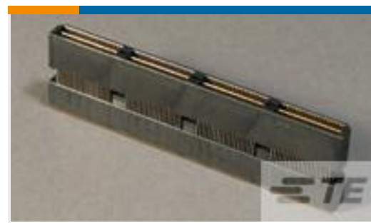
TE Part # 1-1658018-4 MSB0.80PL22ASY112DP,-,10,VCTY