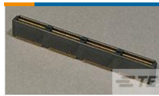
TE Part # 1-1658015-4 MSB0.80PL11ASY112DP,-,10,VCTY