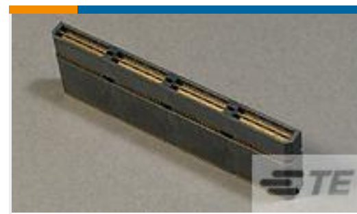
TE Part # 1-1658019-4 MSB0.80PL25ASY112DP,-,10,VCTY