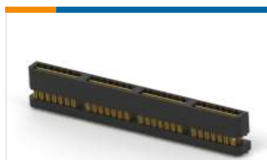
TE Part # 1-1658438-4 MSB0.80PL14ASY112DP,-,10,VCTY