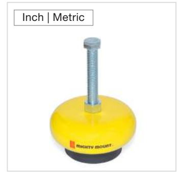
4 Type D With heavy duty pad