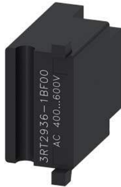
Surge suppressor, varistor, 400 ... 600 V AC, for contactors Size S2, S3