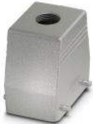
HEAVYCON sleeve housing D50, for double locking latch, height 76 mm, without support 1x M25, straight conductor exit

Please be informed that the data shown in this PDF Document is generated from our Online Catalog. Please find the complete data in the user's documentation. Our General Terms of Use for Downloads are valid ( http://phoenixcontact.com/download )