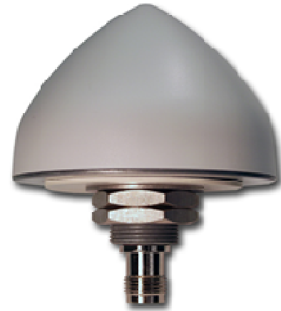
TW3030 Dimensions (mm)

The TW3030 is housed in a compact, industrial-grade weather-proof, domed shaped enclosure. Its radome is available in dark gray or white, it comes with a TNC female connector and a L-bracket for pole mount is available (P/N#23-0040-0).