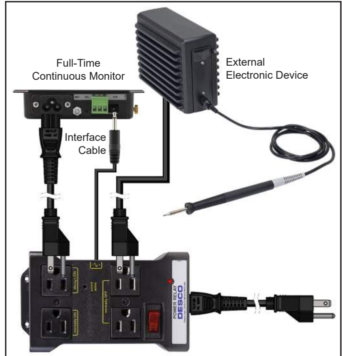
Figure 3. Installing the Power Relay with the 19330 Full-Time Continuous Monitor