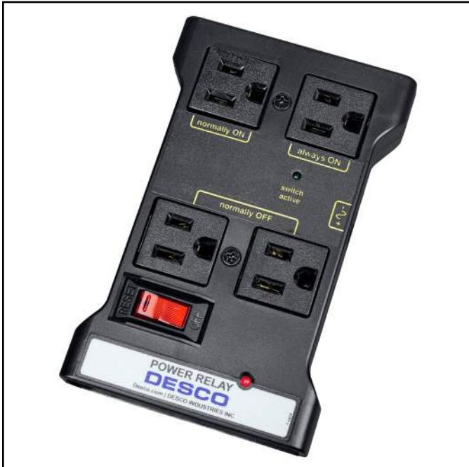
Figure 1. Desco 19333 Power Relay