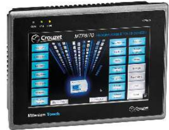
Programmable touch panel MTP8/70