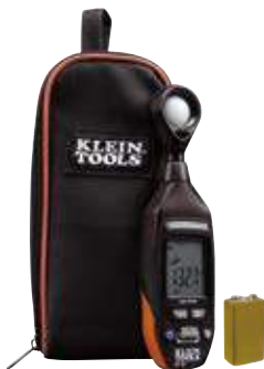
Power On/Off Button

Included Accessories: Carrying Pouch, 9V Battery