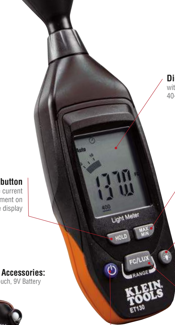
Digital LCD Screen with backlit display and 40-segment bar graph