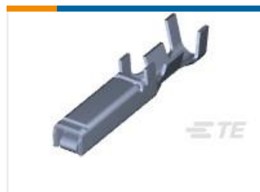
TE Part #175195-2 DYNAMIC D-3 REC CONT/M AU 0.38