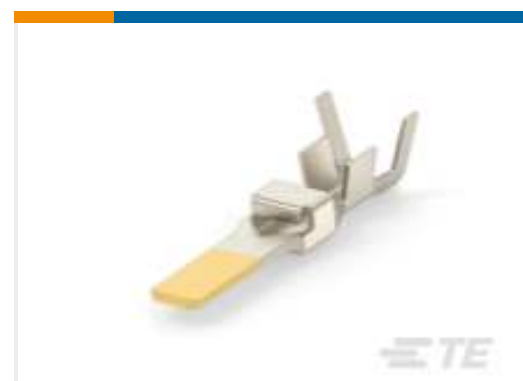
TE Part #917802-2 Contact: Component To Wire ; 20- 45A • 20-8 wire size