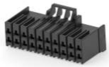
TE Part # CAT-D9934-A75C Receptacle and Tab Housing: 5.08 mm pitch, 600V