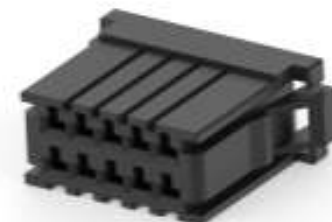
TE Part # CAT-D9934-A75A Receptacle and Tab Housing: 3.81 mm pitch, 250V