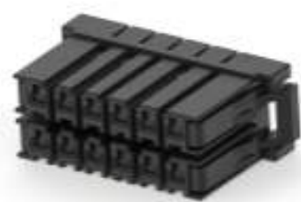
TE Part # CAT-D9934-A75B Receptacle and Tab Housing: 5.08 mm Pitch, 250-600V