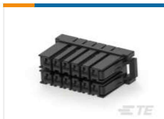
TE Part #1-178128-4 Receptacle and Tab Housing: 5.08 mm Pitch, 250-600V