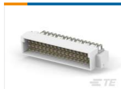
TE Part #4-2271290-0 CELLO,PIN,48P,TH,RA,FG,DIP3.0,CLIP