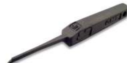
TE Part # 234168-1 EXTRACTION TOOL(DYNAMIC D-3)