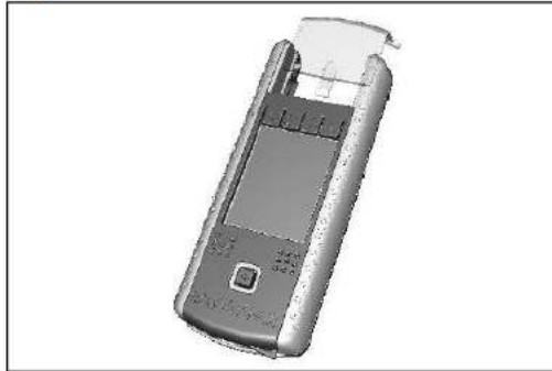
Figure 1. EvoPrimer base