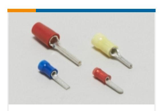
Crimp Wire Pins, Tabs & Ferrules(1)