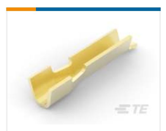
TE Part # 62382-1 SPLICE 25/26 .012 BR