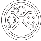
Pin assignment of M12 socket, 3-pos., S-coded, socket side view