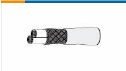
TE Part #316039-004 55A1121-24-0/9-9