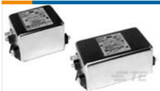
TE Part #6609052-2 10VN1=F7416 S0