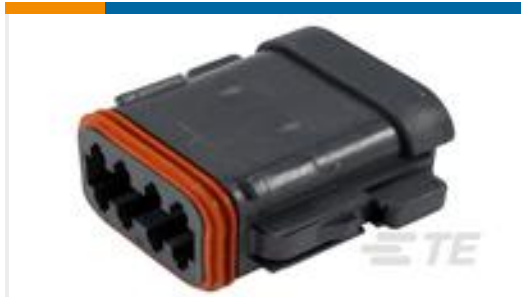
TE Part #DT06-08SA-E005 PLG, 8P, BLK, N, CAP, A