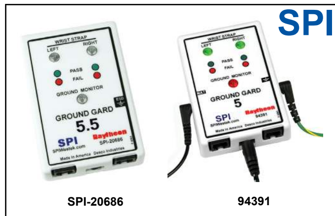
Figure 1. SPI Ground Gard items SPI-20686 and 94391.