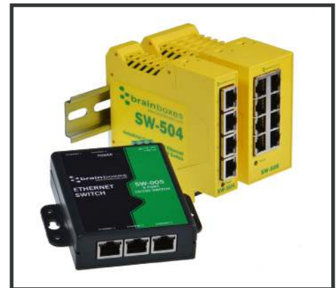
SW Range Switch products available in a range of formats and specifications. www.brainboxes.com