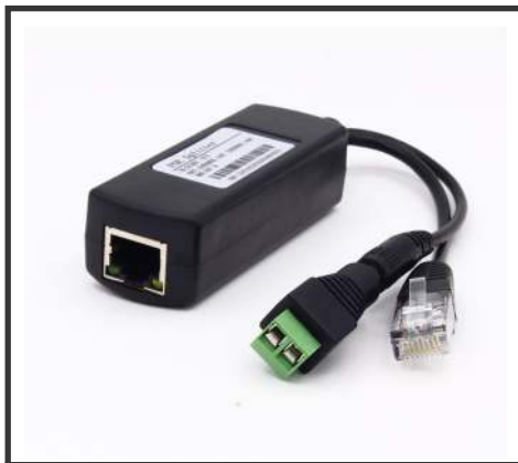
PW-323 PoE Splitter