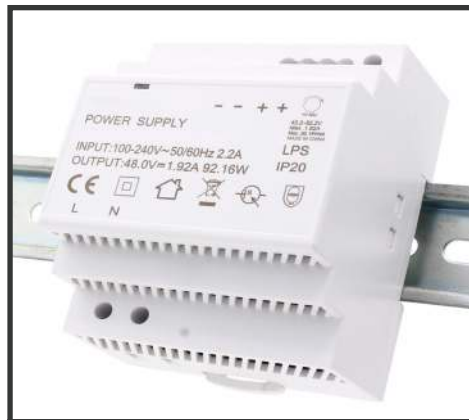
PW-301 DIN Rail Power Supply