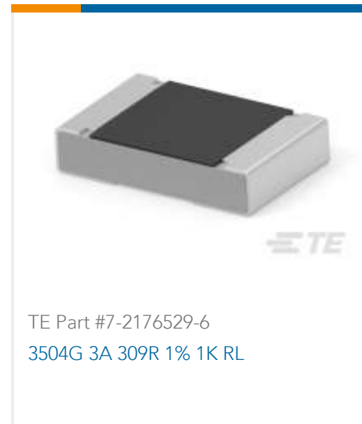
TE Part #7-2176529-6 3504G 3A 309R 1% 1K RL