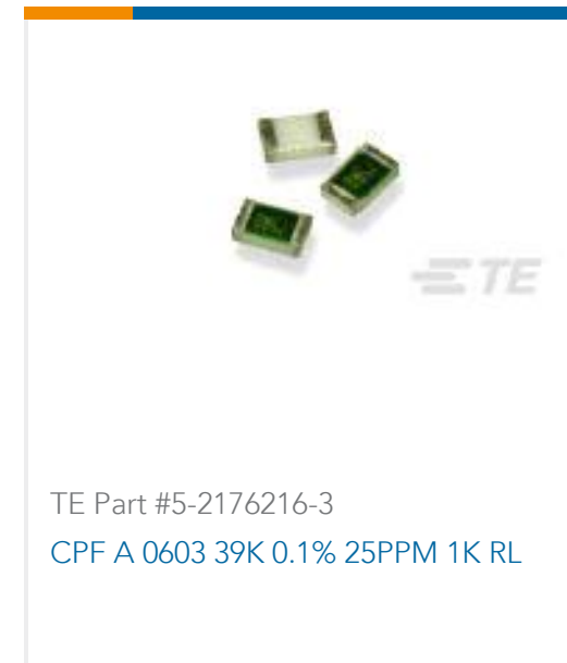
TE Part #5-2176216-3 CPF A 0603 39K 0.1% 25PPM 1K RL