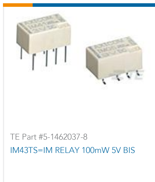
TE Part #5-1462037-8 IM43TS=IM RELAY 100mW 5V BIS