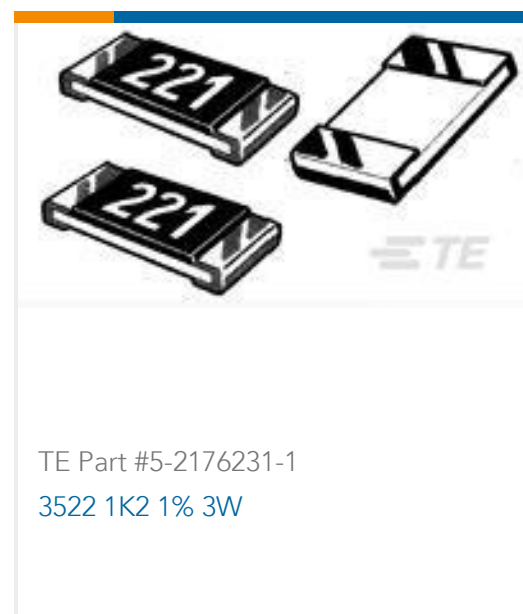
TE Part #5-2176231-1 3522 1K2 1% 3W