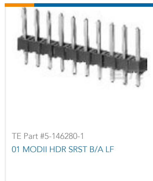
TE Part #5-146280-1 01 MODII HDR SRST B/A LF