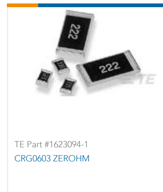
TE Part #1623094-1 CRG0603 ZEROHM