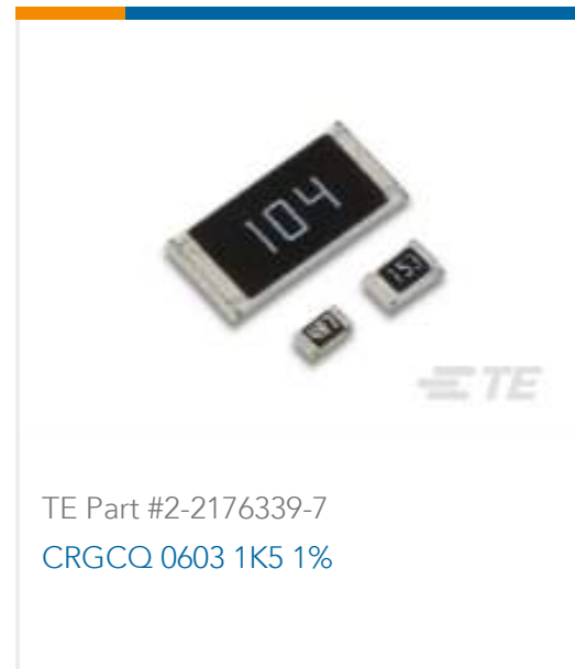
TE Part #2-2176339-7 CRGCQ 0603 1K5 1%