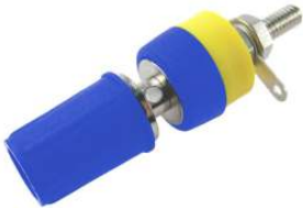
CL1552 - TP2 BLUE UNASSEMBLED