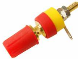
CL15511 - TP2 RED GOLD UNASSEMBLED CL15511A - TP2 RED GOLD ASSEMBLED