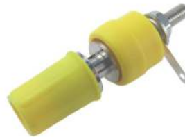
CL1557 - TP2 YELLOW UNASSEMBLED

Current Rating: 15A. Flammability: Min UL94HB