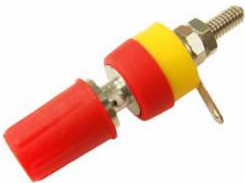
CL1551 - TP2 RED UNASSEMBLED CL1572 - TP2 RED ASSEMBLED