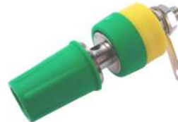
CL1553 - TP2 GREEN UNASSEMBLED CL1573 - TP2 GREEN ASSEMBLED