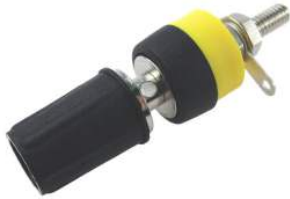
CL1550 - TP2 BLACK UNASSEMBLED CL1575 - TP2 BLACK ASSEMBLED