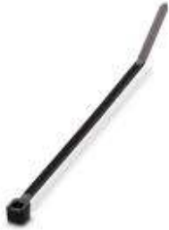
Cable tie, resistant to UV rays, dimensions: L x W, 200 x 2.5 mm, color: black

Please be informed that the data shown in this PDF Document is generated from our Online Catalog. Please find the complete data in the user's documentation. Our General Terms of Use for Downloads are valid ( http://download.phoenixcontact.com )