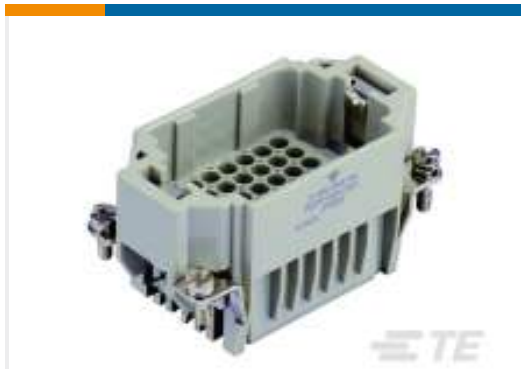
TE Part #T2030422101-000 HDD-042-M