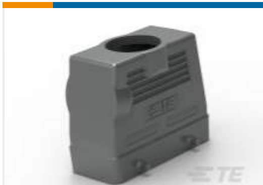
TE Part #T1240160129-000 H16B-TGH-PG29