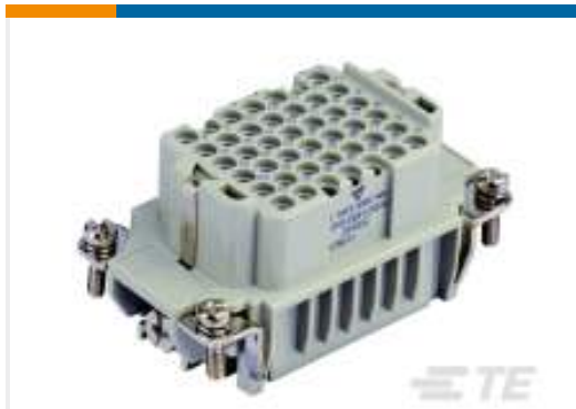
TE Part #T2030422201-000 HDD-042-F