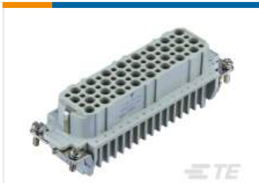
TE Part #T2020642201-000 HD-064-F