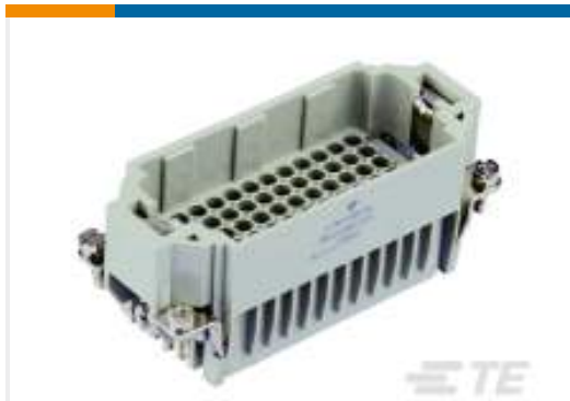
TE Part #T2030722101-000 HDD-072-M