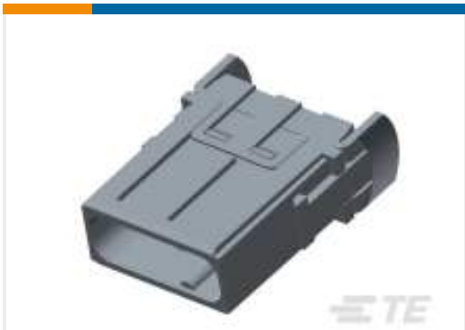
TE Part #T2111032101-000 HMN-003-M