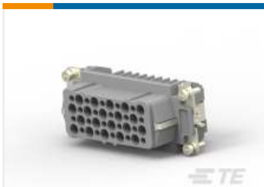
TE Part #T2020402201-100 HD-040-FJ