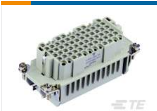
TE Part #T2030722201-000 HDD-072-F