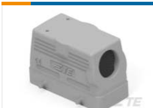
TE Part #T1210160121-200 H16B-TS-PG21