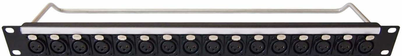
CP30182 - 1U Panel loaded with 16 x XLR 3DCF . M3 Holes. Front mounted. Solder tag at rear.