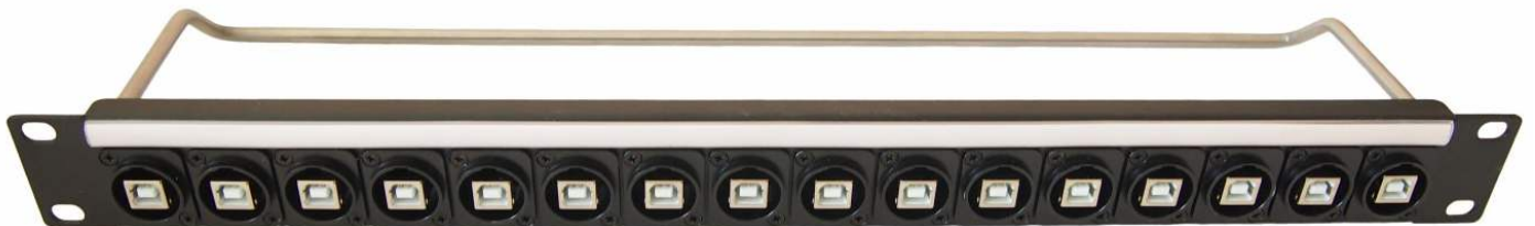
CP30176 - 1U Panel loaded with 16 x USB2 B-A Connectors. M3 Holes. Front mounted