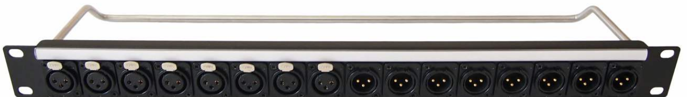
CP30183 - 1U Panel loaded with 8 x XLR 3DCF + 8 x XLR 3DCM. M3 Holes. Front mounted. Solder tag.