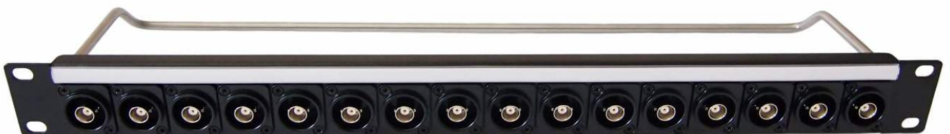
CP30184 - 1U Panel loaded with 16 x 50Ω Insulated BNC Connectors. M3 Holes. Front mounted