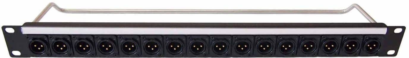
CP30181 - 1U Panel loaded with 16 x XLR 3DCM . M3 Holes. Front mounted. Solder tag at rear.