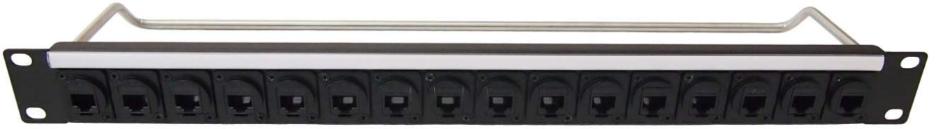
CP30172 - 1U Panel loaded with 16 x CAT6 RJ45 Connectors. #4-40 holes. Front mounted CP30173 - 1U Panel loaded with 16 x CAT6 RJ45 Connectors. M3 holes. Front mounted