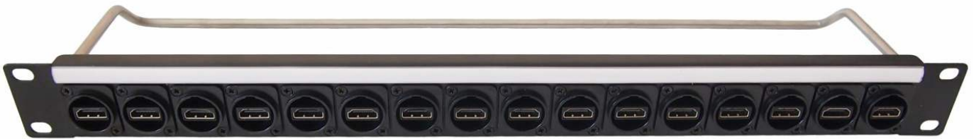
CP30174 - 1U Panel loaded with 16 x HDMI A-A Connectors. M3 Holes. Front mounted