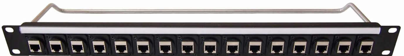
CP30177 - 1U Panel loaded with 16 x CAT6A Connectors. M3 Holes. Front mounted