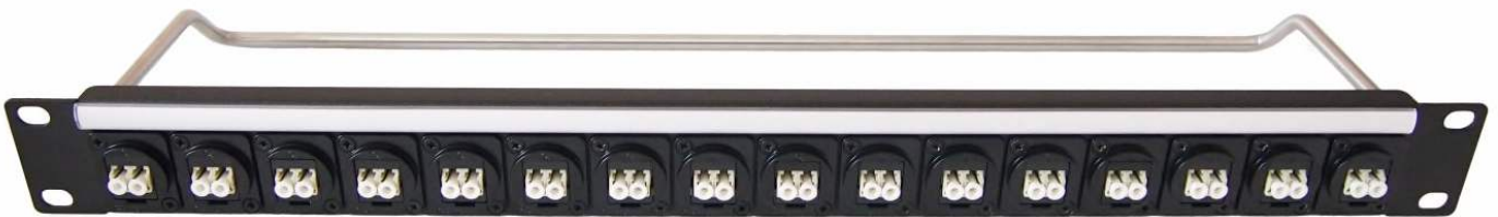
CP30180 - 1U Panel loaded with 16 x LC Duplex MM Connectors. M3 Holes. Front mounted