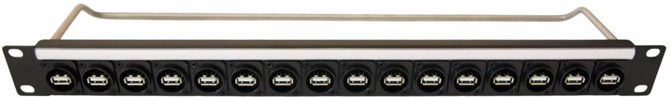
CP30175 - 1U Panel loaded with 16 x USB2 A-B Connectors. M3 Holes. Front mounted