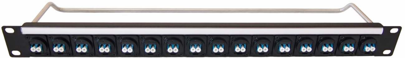
CP30179 - 1U Panel loaded with 16 x LC Duplex SM Connectors. M3 Holes. Front mounted