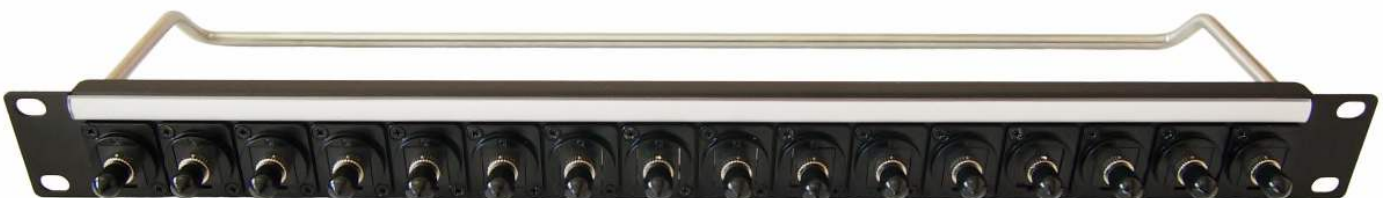
CP30178 - 1U Panel loaded with 16 x ST Fibre Connectors. M3 Holes. Front mounted