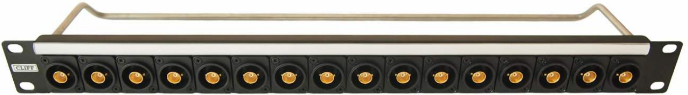
CP30186 - 1U Panel loaded with 16 x Gold BNC 75Ω 12GHz, M3 Holes. Front mounted

For further information, contact sales@cliffuk.co.uk