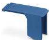
Covering hood, length: 144 mm, width: 41 mm, height: 33 mm, color: blue