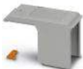
Covering hood, length: 144 mm, width: 41 mm, height: 33 mm, color: gray