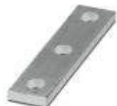
Connection rail, number of positions: 3, color: silver