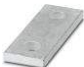
Connection rail, number of positions: 2, color: silver