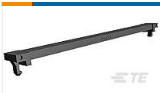
TE Part #111547-1 010 UNIV I/O STRAIN RELIEF