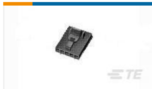
TE Part #104257-3 04 MTE RCPT HSG SR LATCH .100