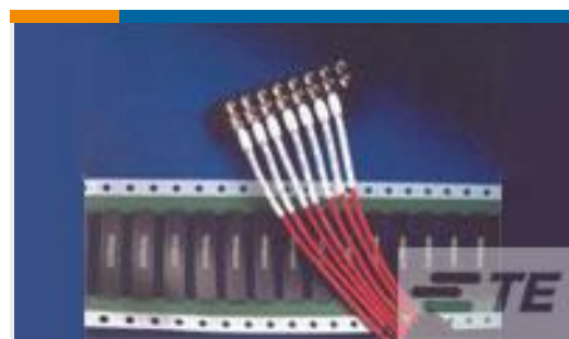
TE Part #D47690-000 HT-SCE-1K-3/32-2.0-S1-9