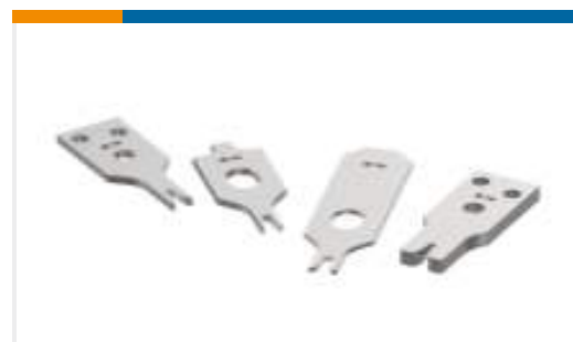
TE Part #4-1803224-4 CRIMPER,WIRE F