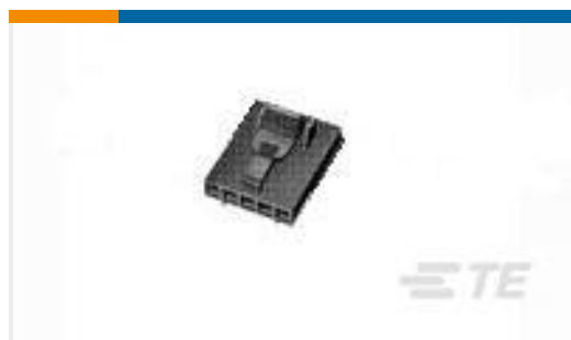
TE Part #104257-4 05 MTE RCPT HSG SR LATCH .100