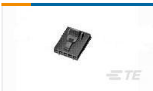
TE Part #104257-1 02 MTE RCPT HSG SR LATCH .100