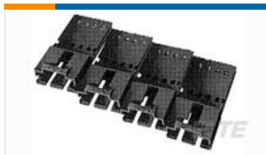
TE Part #103653-7 08 MTE SHRD PIN HSG SR LATCH