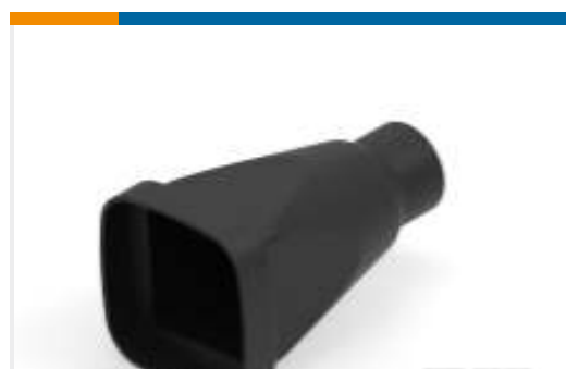
TE Part #DRB48-60-BT BOOT, 48/60P, PLG/REC, ST, BLK