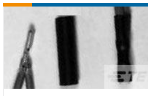
TE Part #520206P036 RT-3-NO.1-0-1IN