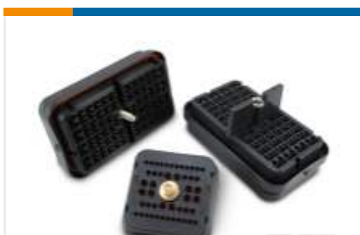
TE Part #DRB12-128PAE-L018 DEUTSCH DRB Housings