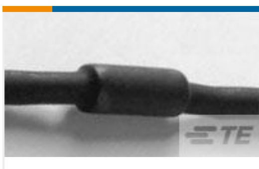
TE Part #A23899-000 TAT-125-1-0-1.5IN