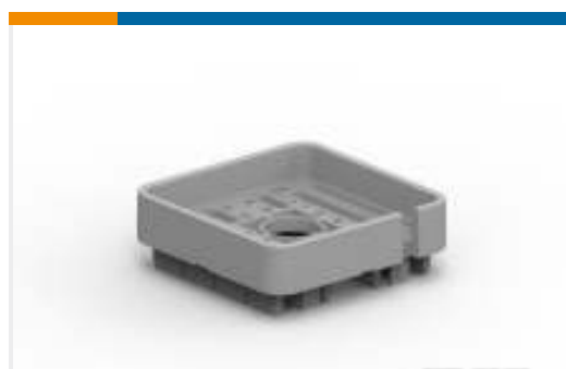
TE Part #WB-51SAL DEUTSCH DRB Wedgelocks