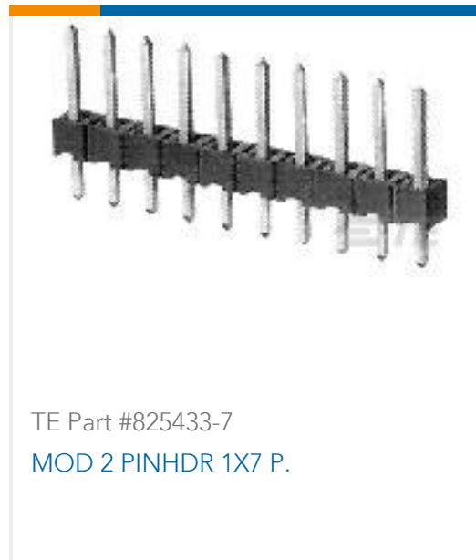
TE Part #825433-7 MOD 2 PINHDR 1X7 P.