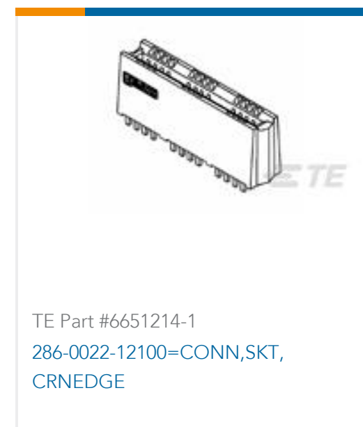
TE Part #6651214-1 286-0022-12100=CONN,SKT, CRNEDGE