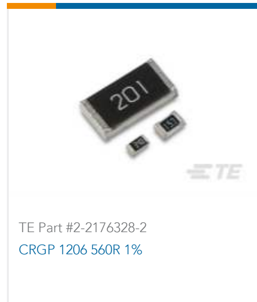
TE Part #2-2176328-2 CRGP 1206 560R 1%