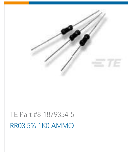
TE Part #8-1879354-5 RR03 5% 1K0 AMMO