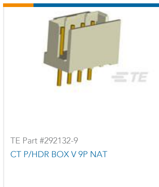
TE Part #292132-9 CT P/HDR BOX V 9P NAT