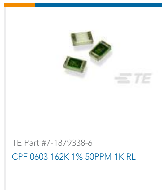
TE Part #7-1879338-6 CPF 0603 162K 1% 50PPM 1K RL