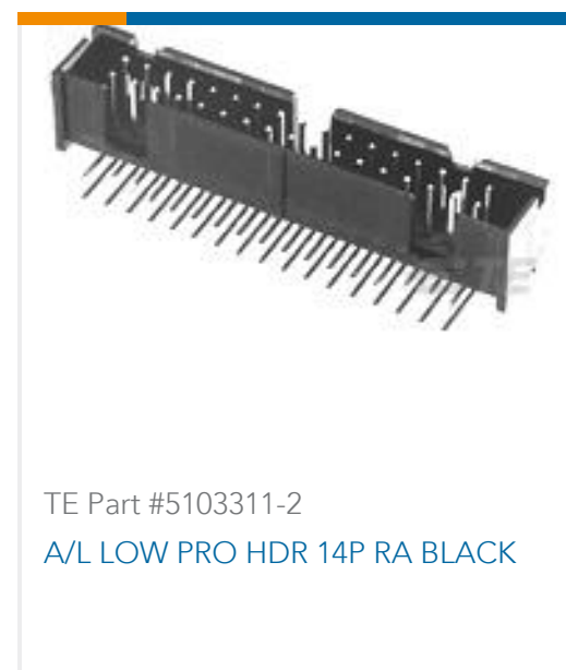
TE Part #5103311-2 A/L LOW PRO HDR 14P RA BLACK