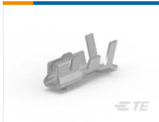
TE Part # 2232983-1 EP 2.5 LIF RCPT CONTACT, 24-20 AWG