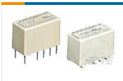
TE Part #2-1393788-0 V23079A1006B301