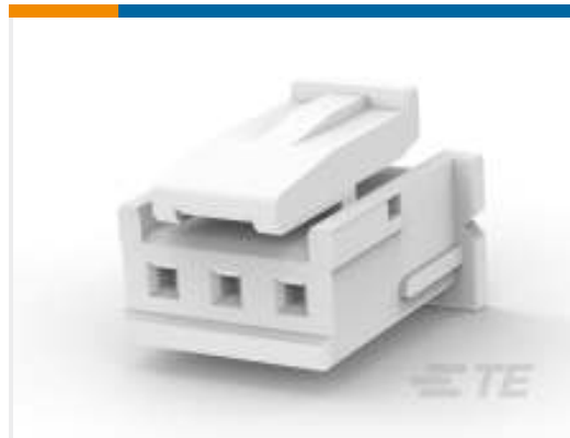
TE Part # 1969442-3 EP 2.5 TPA Housing, 3 Pos