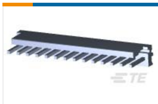
TE Part #1-640445-4 14P MTA156 HDR ASSY FL/STR SN