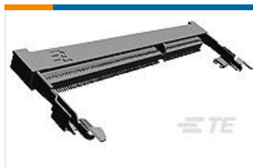
TE Part #2013289-1 SEMI-HARD TRAY DDR3 204P 5.2H STD