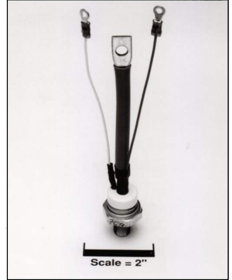
2N1909-2N1792 Phase Control SCR 70 Amperes Average (110 RMS), 600 Volts