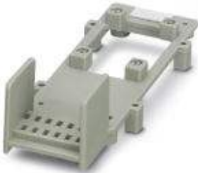
Plug receptacle, for plug assembly board, with strain relief, for accommodating contact inserts, type HC-B 6

Please be informed that the data shown in this PDF Document is generated from our Online Catalog. Please find the complete data in the user's documentation. Our General Terms of Use for Downloads are valid ( http://download.phoenixcontact.com )