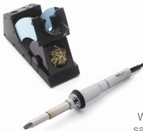
WXP 200 set with safety rest WDH 31

Order No. 0052920299 (0052920199 for pencil only)