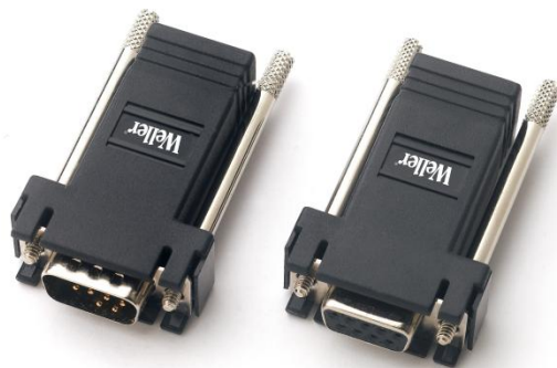
WX Adapter for PC Order No. 0058764711

Order No. 0052920999 (0052920899 for pencil only)