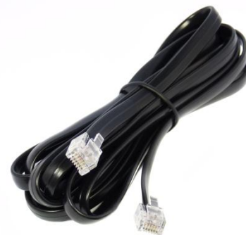
WX connection cable Order No. 0058764710