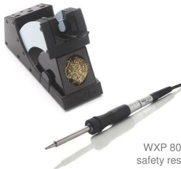
WXP 80 set with safety rest WDH 10

Order No. 0052921299 (0052921199 for pencil only)