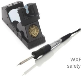
WXP 65 set with safety rest WDH 10