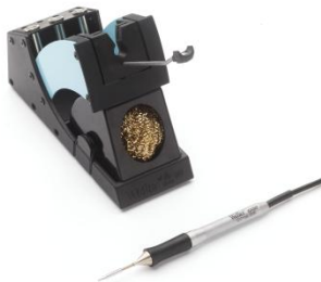
WXMP set with safety rest WDH 50

Order No. 0052920699 (0052920599 for pencil only)