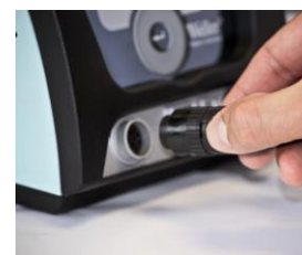
WX tool connection