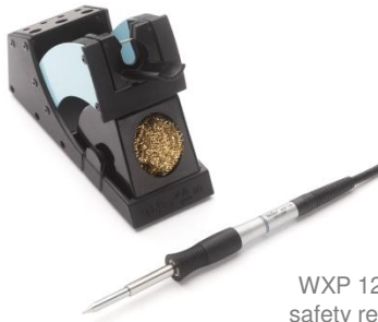
WXP 120 set with safety rest WDH 10