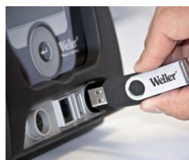
Multi-purpose USB port