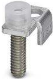
Chain bridge, Number of positions: 1, Color: silver

Please be informed that the data shown in this PDF Document is generated from our Online Catalog. Please find the complete data in the user's documentation. Our General Terms of Use for Downloads are valid ( http://phoenixcontact.com/download )