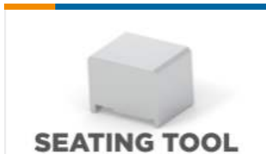
TE Part # 2018524-1 TOOL, SEAT 4 PR 10 COL,BP CONN