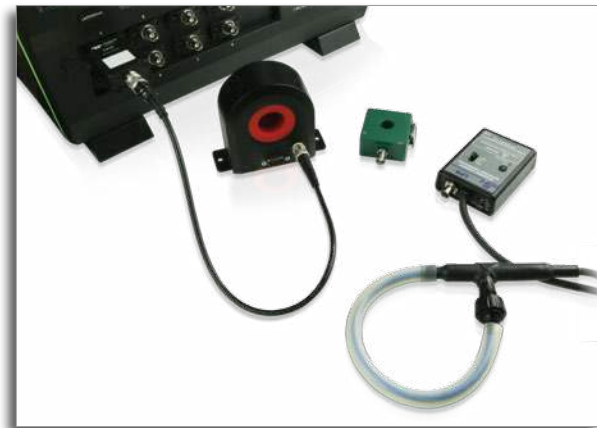
CA10 ProBus current adapter attached to a Danisense Current Transducer. Also shown is a Pearson Current Transformer and a PEM-UK Rogowski Coil, which are also third party devices that can be used with the CA10.