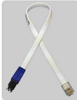
Tag-Connect cable for connector-less PCB's