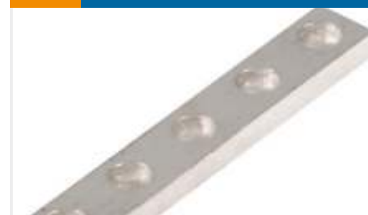
TE Part #1SNA164585R1700 BJS10-2