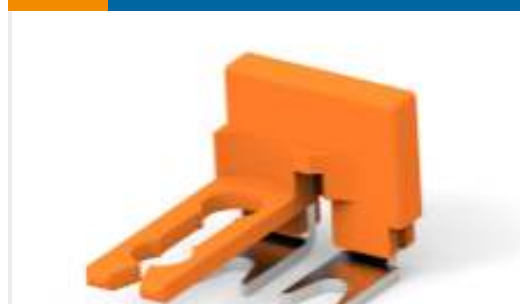
TE Part #1SNK900656R0000 SC-JB8-2-OR