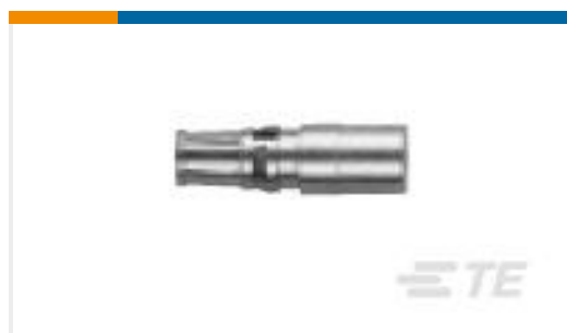
TE Part #2-1105151-1 HSS-C-Bu.Ag.4,0 qmm