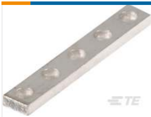
TE Part #1SNA177654R0000 BJS10-20