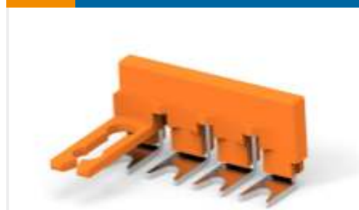
TE Part #1SNK900658R0000 SC-JB8-4-OR