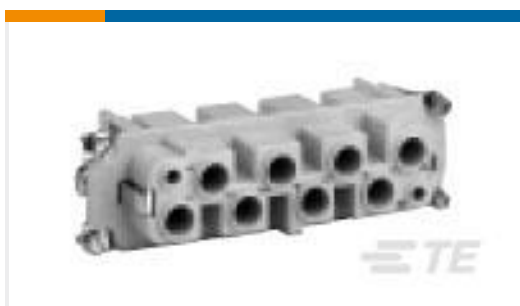
TE Part #2-1104202-3 HSS.8.BU.C