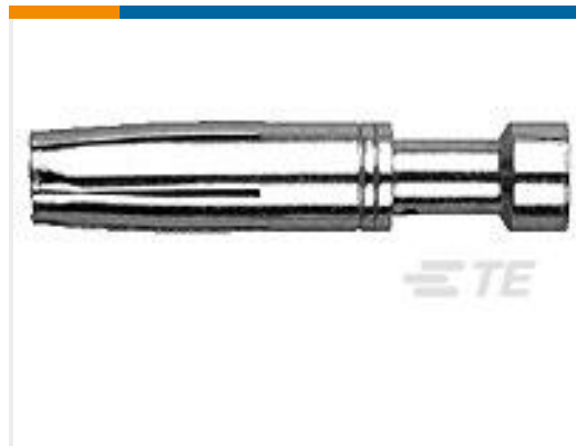
TE Part #3-1105101-1 HE/HA-C-BU.AG.1,5