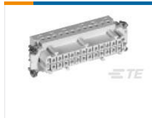
TE Part #2-1103641-9 HE.24.BU.C.B 25-48