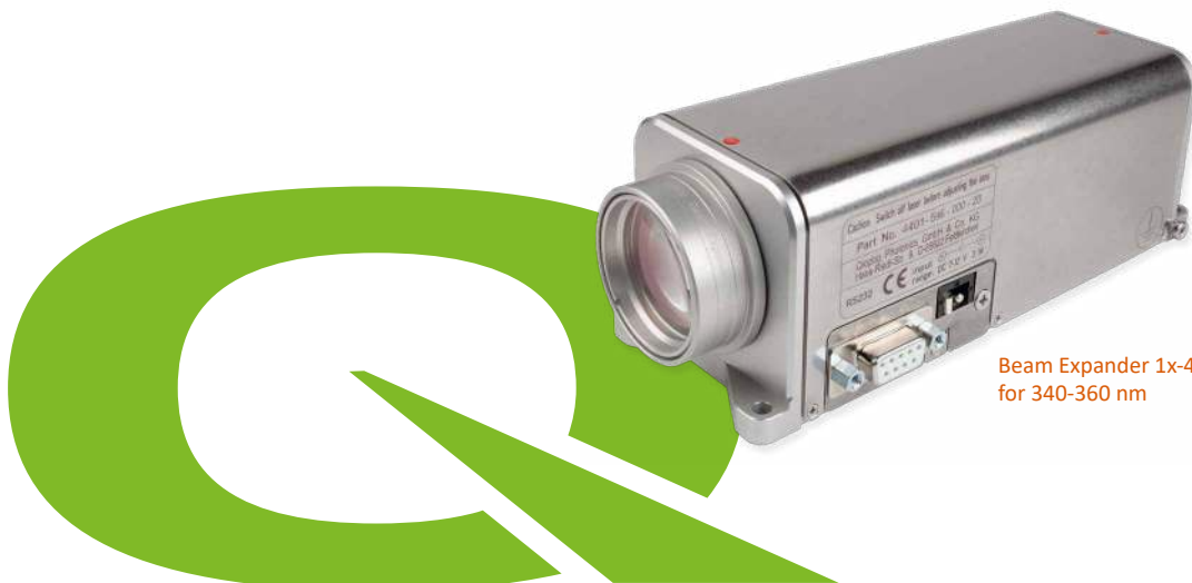
Beam Expander 1x-4x for 340-360 nm