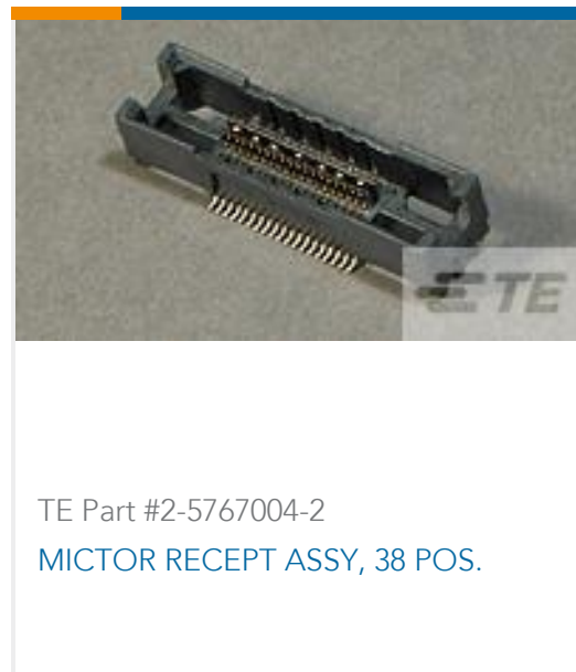
TE Part #2-5767004-2 MICTOR RECEPT ASSY, 38 POS.