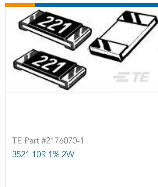
TE Part #2176070-1 3521 10R 1% 2W