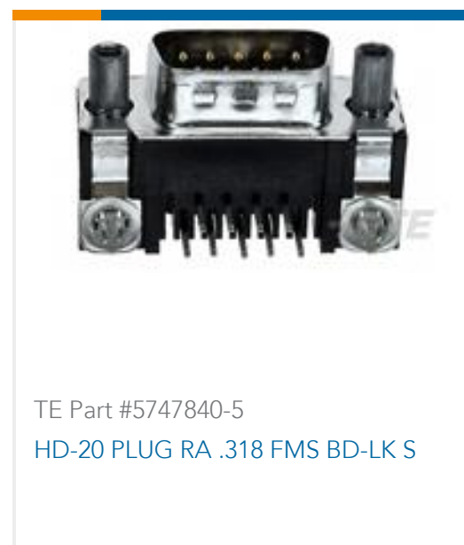
TE Part #5747840-5 HD-20 PLUG RA .318 FMS BD-LK S