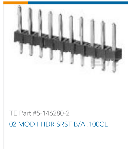
TE Part #5-146280-2 02 MODII HDR SRST B/A .100CL