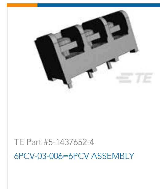
TE Part #5-1437652-4 6PCV-03-006=6PCV ASSEMBLY