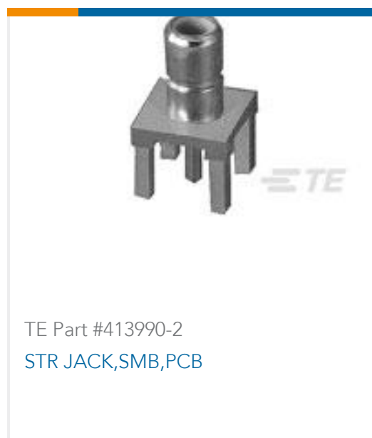
TE Part #413990-2 STR JACK, SMB, PCB