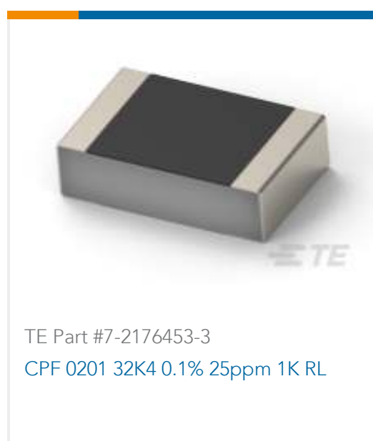
TE Part #7-2176453-3 CPF 0201 32K4 0.1% 25ppm 1K RL