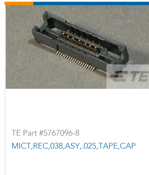
TE Part #5767096-8 MICT, REC, 038, ASY, 025, TAPE, CAP