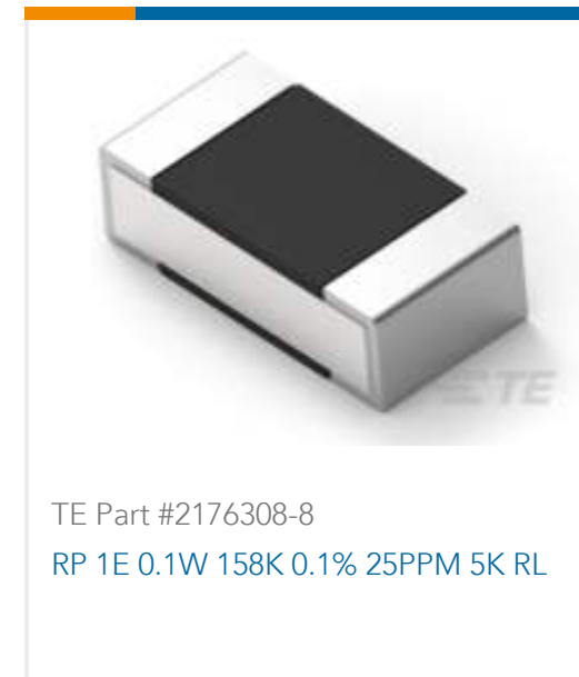
TE Part #2176308-8 RP 1E 0.1W 158K 0.1% 25PPM 5K RL