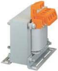
Transformer terminal block, Connection method: Screw connection, Length: 28.5 mm, Width: 29.5 mm, Height: 19 mm, Color: gray

Please be informed that the data shown in this PDF Document is generated from our Online Catalog. Please find the complete data in the user's documentation. Our General Terms of Use for Downloads are valid ( http://phoenixcontact.com/download )