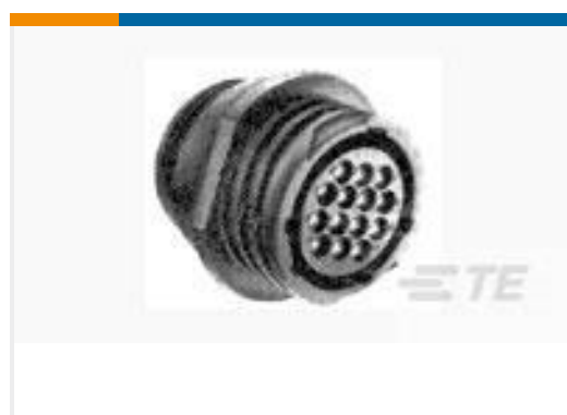
TE Part #206430-2 CPC 11-4 Free Hanging Receptacle