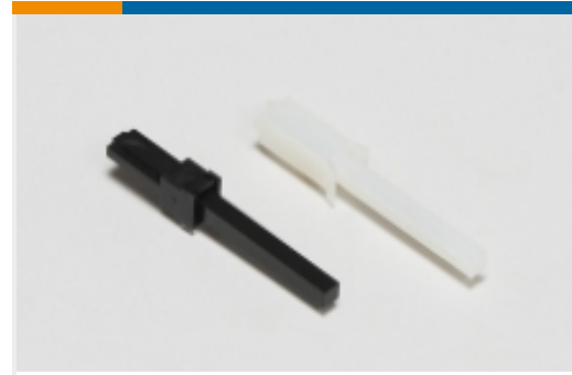
Circular Connector Keying Plugs(2)