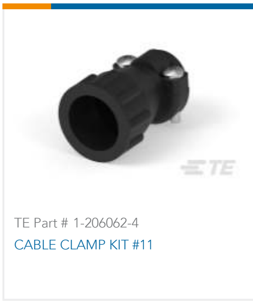
TE Part # 1-206062-4 CABLE CLAMP KIT #11