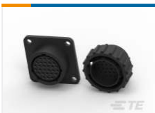
TE Part #205838-1 CPC Connectors, Series 2