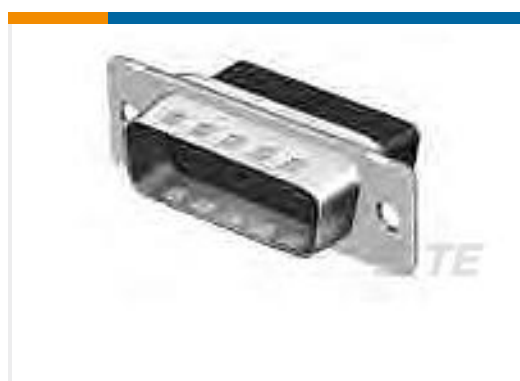
TE Part #205210-8 PLUG ASSY SIZE 4