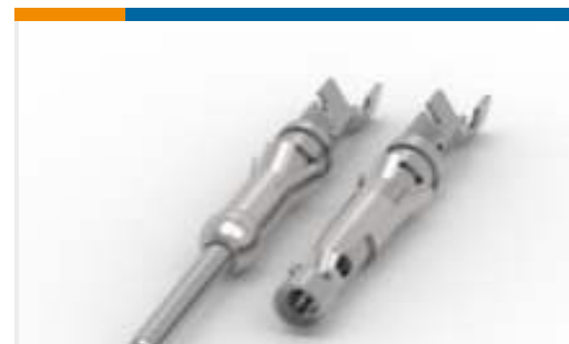
TE Part #66361-3 Pin and Socket Contacts, Type III, LP