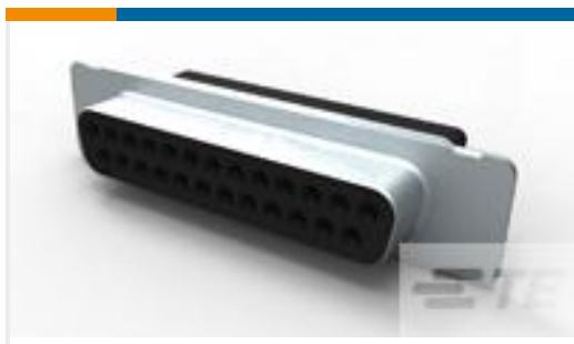
TE Part #5205207-1 HD RECEPT ASSY SIZE 3