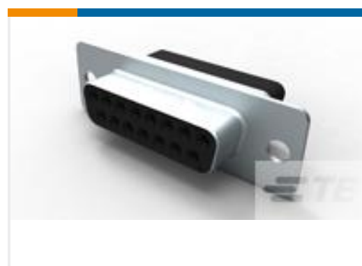
TE Part #205205-7 CRIMP SNAP RCPT ASSY, SIZE 2